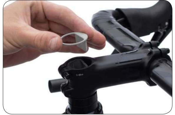
*this spacer is a sample. Spacer in delivery will be black

Next mount the expander and use a torque spanner to tighten it to 7 Nm.